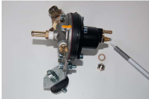
Figure 3: Complete Assembly