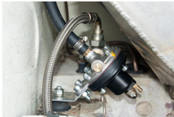
Figure 4: Assembly installed