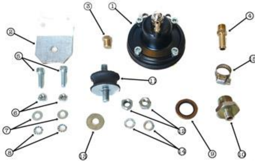
Figure 1: Kit Contents for Parts List number 322